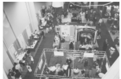
Stage Expo, at the Long Beach Convention & Entertainment Center, will be larger than the 1998 edition which drew thousands to the appealing Southern California city.