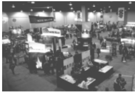
Stage Expo 2000 in Denver was the third largest Stage Expo

David L. Adams Associates, Inc. Alcone/Mutual Hardware American Harlequin Corporation Apollo Design Technology Automatic Devices Company AVAB Transtechnik Baer Fabrics Barbizon Boston University CAE/Leprecon California Institute of the Arts California State University, Fullerton CityTheatrical, Inc. J.R. Clancy, Inc. Clear-Com Intercom Systems Cobalt Studios Coffing Hoists Colortran, A Leviton Company Columbus McKinnon Corporation Cornish College of the Arts Costume Computer Software Consortium The Crosby Group, Inc. Custom Rigging Systems, Inc. Dazian LLC Diehl Graphsoft, Inc. Electronic Theatre Controls, Inc. Entertainment Design/LD/LDI ESTA Farthingales Florida State University Flying By Foy Focal Press Future Light GALA, a division of PACO Corporation GAM Products, Inc. Graftobian Theatrical heatshrink.com H & H Specialties Inc. High End Systems, Inc. High Output, Inc. Hy-Safe Technology University of Illinois at Urbana-Champaign Irwin Seating Company Kaufman-Davis Studio Kryolan Corporation LEE Filters Le Maitre Special Effects