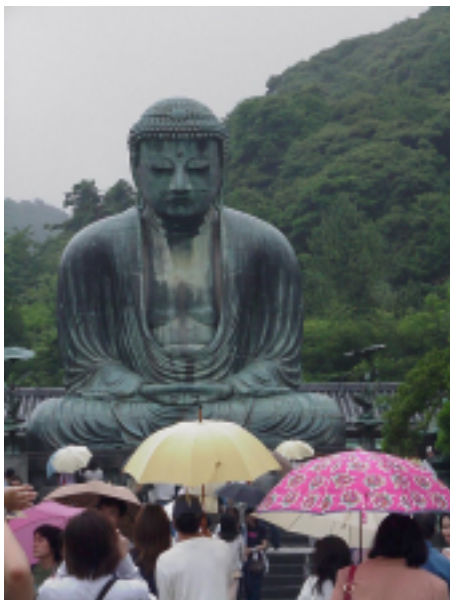
Following the meetings, part of the group elected to make a visit Kotoku-in (the giant statue of Buddha) in Kamakura