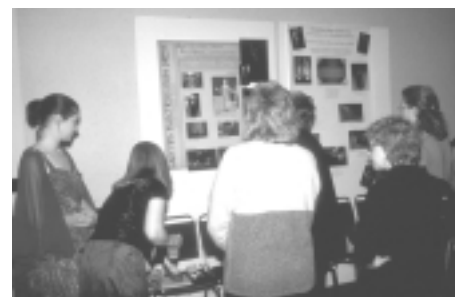
Interested observers are gathered around a Poster Session entry in Denver

ommend the nine hour drive in a crowded van) and to bond with non-Central students. I think it is just awesome to get to meet other students from across the country that share your interests and passions. I was so proud of Central College for sending as many students as we did, and for other schools showing so much support for their students. Just to wrap up, I want to say that I am so glad that I was able to go to this conference. I couldn't have done that without a scholarship. I attended more sessions than I can recount here and learned more in a week than I ever imagined. I hope everyone had as wonderful a time as I did and that more students will be able to share in these types of experiences.