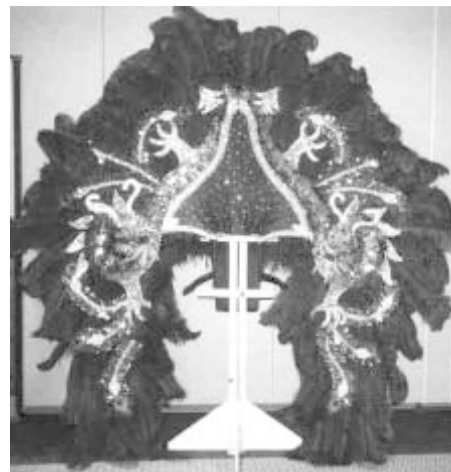
The intricacy and beauty of Mardi Gras Krewe costumes highlight a session at the 42 nd Annual Conference & Stage Expo in New Orleans.