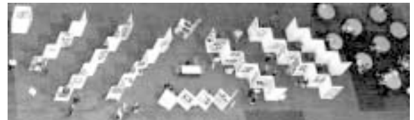
The Design Expo display from the top of the Louisiana Superdome.