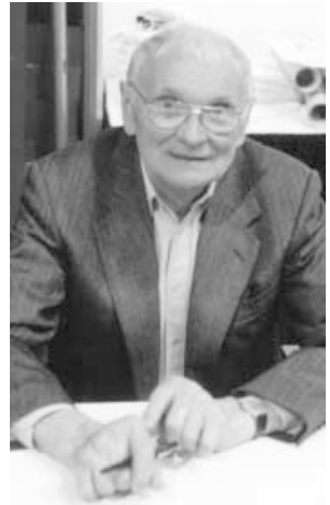
Josef Svoboda at the 1997 OISTAT World Congress held in conjunction with the USITT Annual Conference & Stage Expo in Pittsburgh, Pennsylvania.

In 1986 the USITT Award was given to Svoboda. It was actually presented to him at a ceremony which took place at the