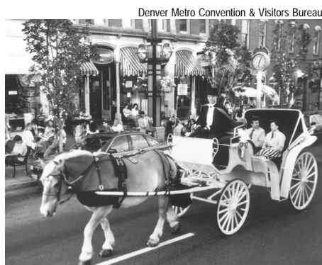
Horse-drawn carriages on Larimer Square