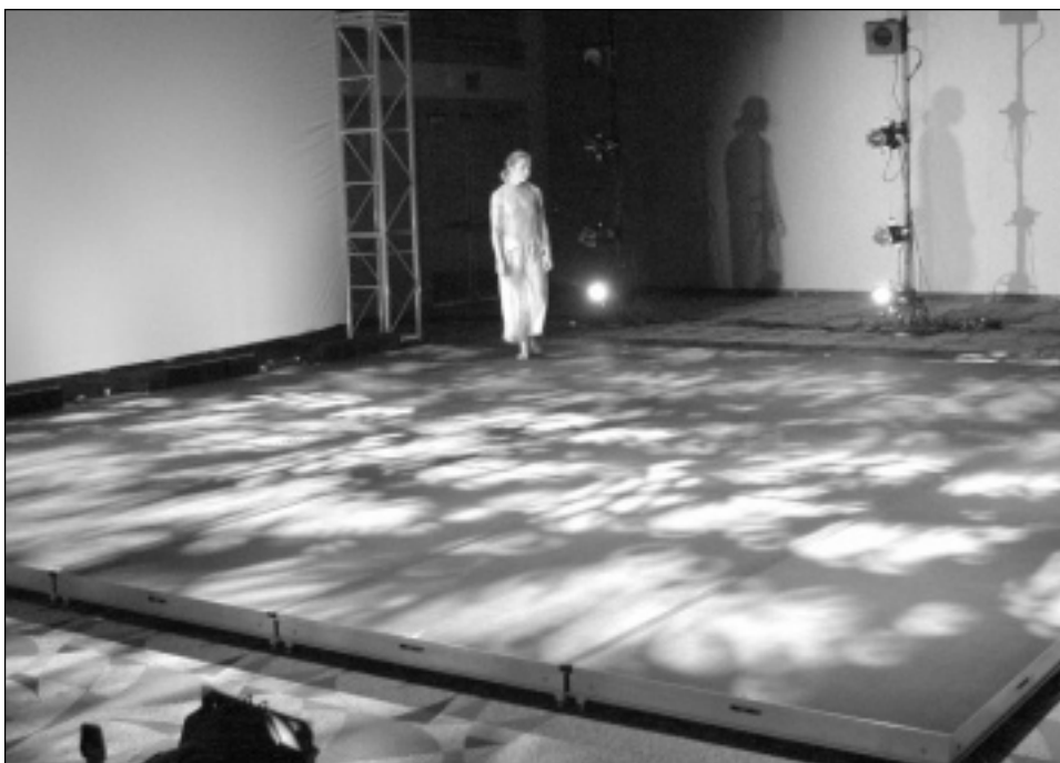
The Lighting Commission's Light Lab in 2003.

* All presenters and award winners are scheduled subject to the unpredictable elements which affect all performing arts professionals.