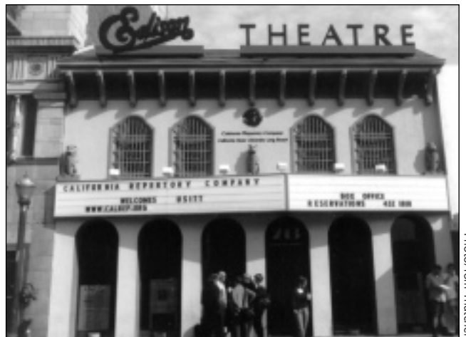
The Edison Theatre, site of a Professional Development Workshop when USITT visited Long Beach in 2001, is an outstanding venue.

In addition to California State University Long Beach's Theatre Department (discussed in Part 1) Long Beach City College (LBCC) has an active Department of Theatre, Dance and Film. Two theatres, a black box/flexible-seating theatre and a traditional proscenium house, are home to a year-round schedule of plays. LBCC