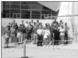
Southern California section members on tour.