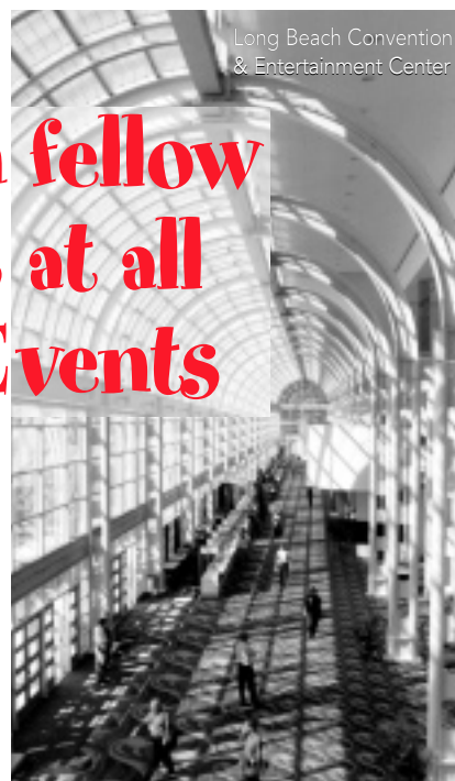
Long Beach Convention & Entertainment Center