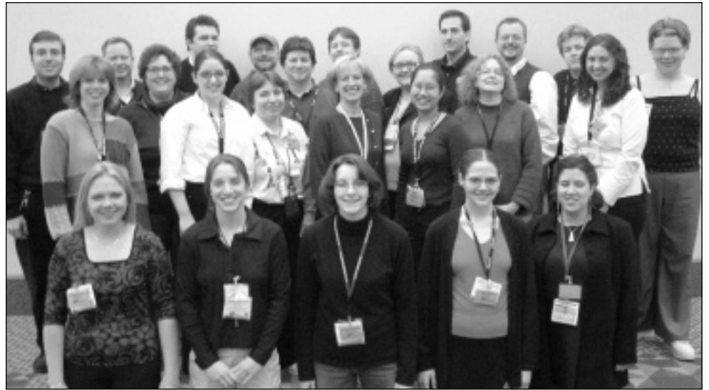
Mentors and mentees who participated in the 2003 Stage Management Mentor Project in Minneapolis, Minnesota gather for a group photograph.

The application deadline is December 31, 2003, so don't delay.