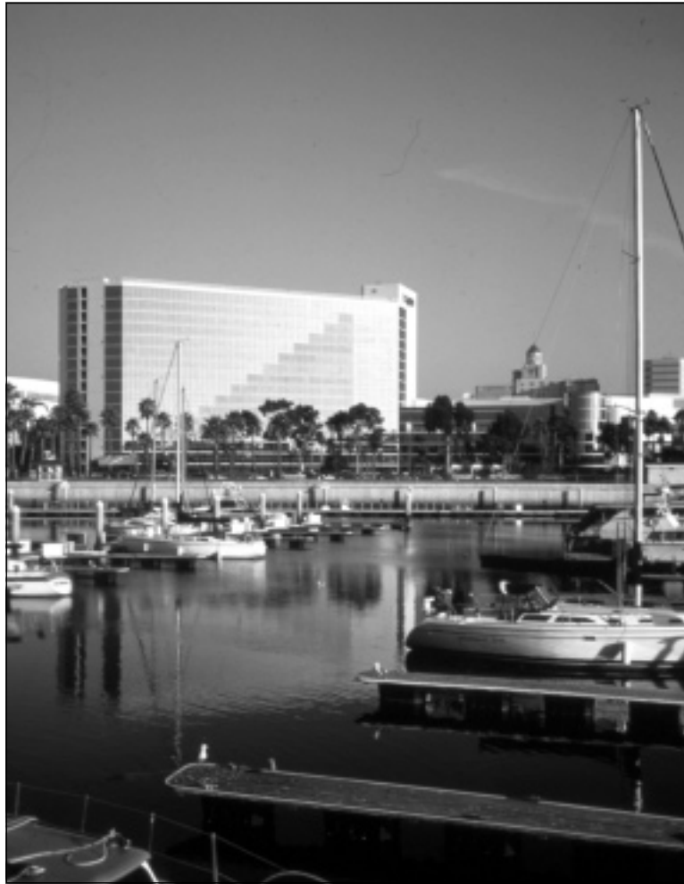
Many guest rooms at the Hyatt Regency in Long Beach have been renovated since USITT's last visit in 2001 and now sport a lighter and more modern look.

less expensive. However, booking such housing can greatly increase the expense of producing the conference and limit our choice of possible conference sites. Before deciding, please take the time to review USITT's housing choices. Using our housing assists the organization and our ability to provide the quality Conferences our members expect and enjoy.