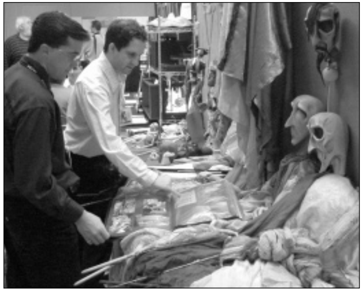
Young Designers' Forum participants share their work.

Internationally-acclaimed Jan Dusek is designing sets and costumes for the Loyola Marymount University production of The Persians by Aeschylus which will open during the USITT conference. This dynamic creative exchange and interaction between Eastern European scenographic approaches and American