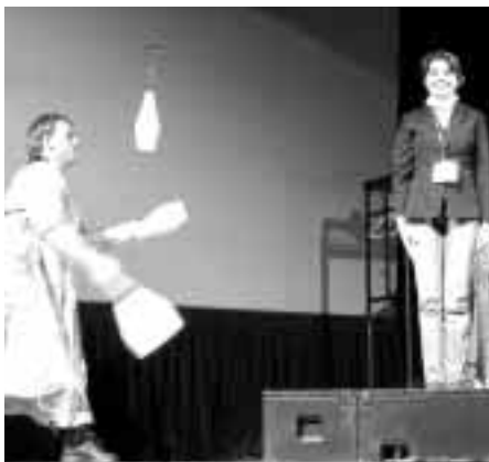
Jugglers from Wenger Corp. demonstrated their agility during the New Product Showcase in Minneapolis.